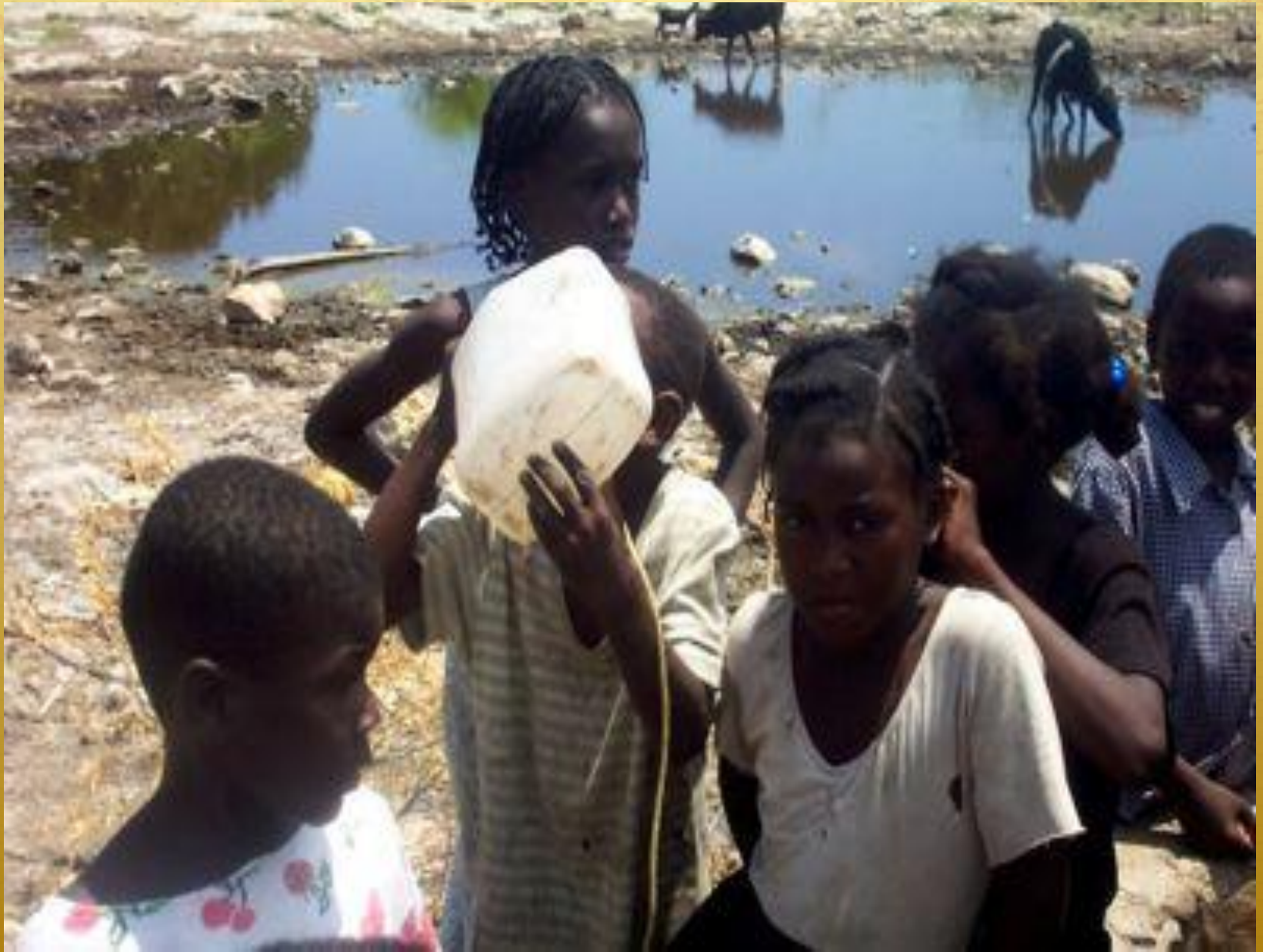
Children drinking polluted water