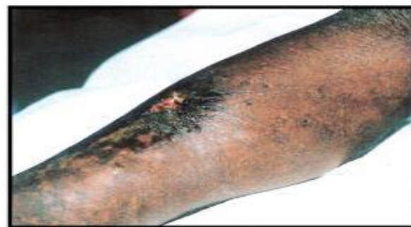
Patient had a leg injury form a machete. He had made a poultice from bird droppings and leaves